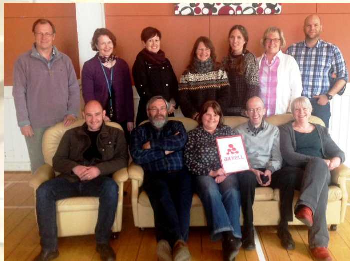
Partner Meeting 4 in Finland

Internet: http://workmentor.vma.is http://www.workmentor.eu