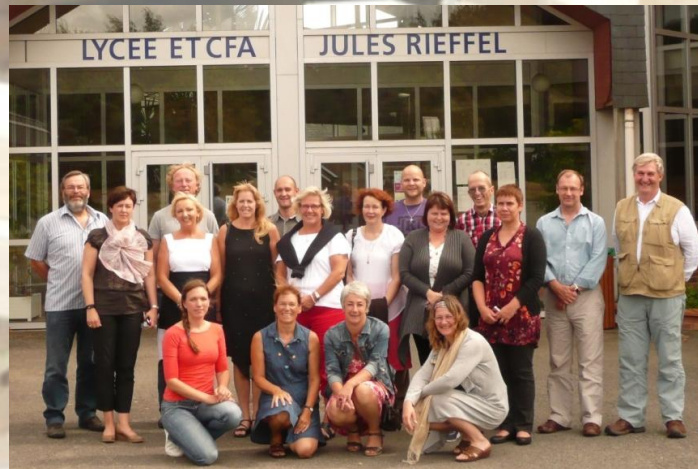
Partner meeting 3 in France